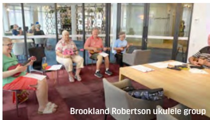
Brookland Robertson ukulele group