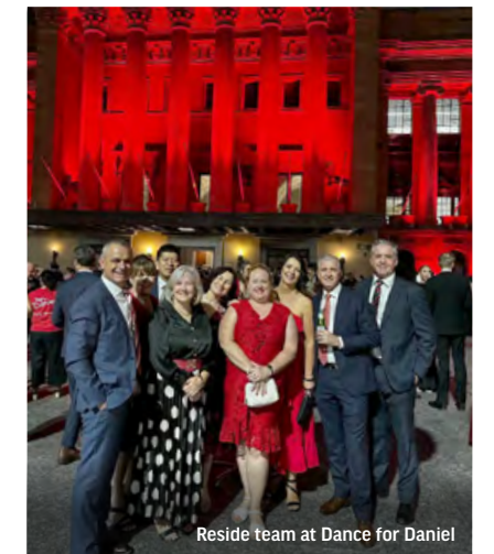
Reside team at Dance for Daniel