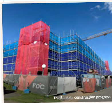
The Banksia construction progress