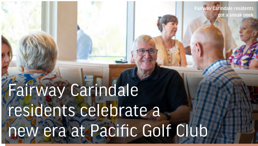
Fairway Carindale residents got a sneak peek