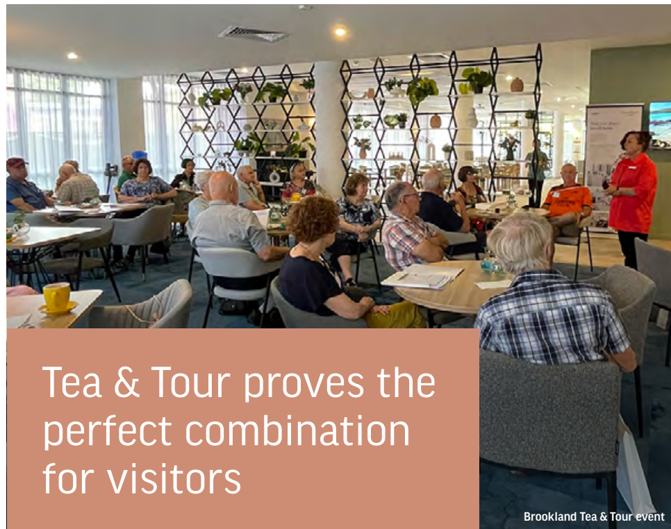
Brookland Tea & Tour event

Learn more about The Banksia and read the full construction update at brookland.com.au