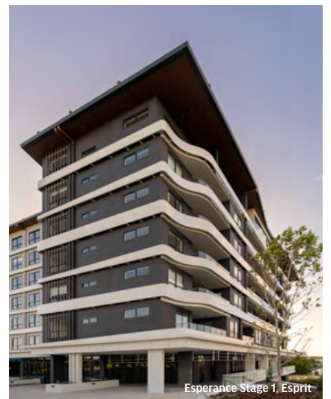
Esperance Stage 1, Esprit

To learn more about Esperance's second stage, Essence, and read the full construction update, visit esperancehopeisland.com.au